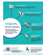
SGNA Member Benefits